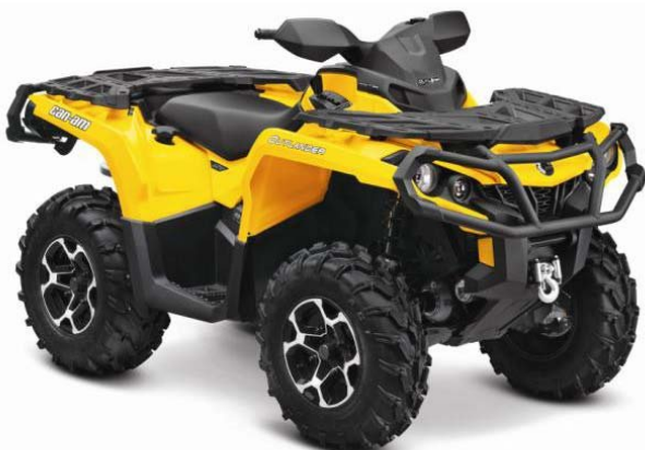
OUTLANDER 650 XT EFI