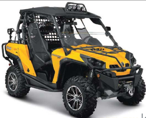
COMMANDER 800 DPS