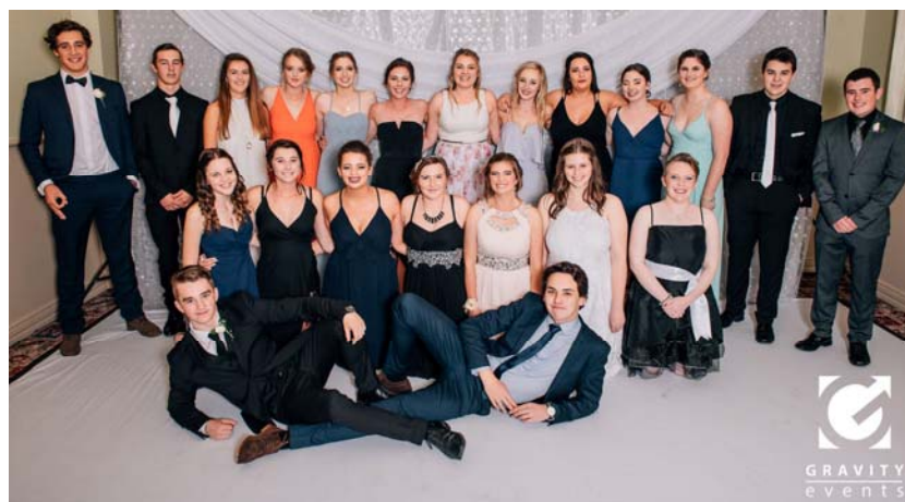
Year 13 at the School Ball