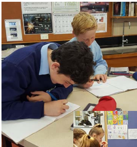
Junior students back into their school work for term 3.