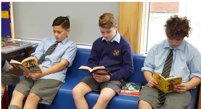
7MO boys during class reading time

The annual meeting will be held in the Senior Citizens rooms at 1.30pm on Monday August 14.